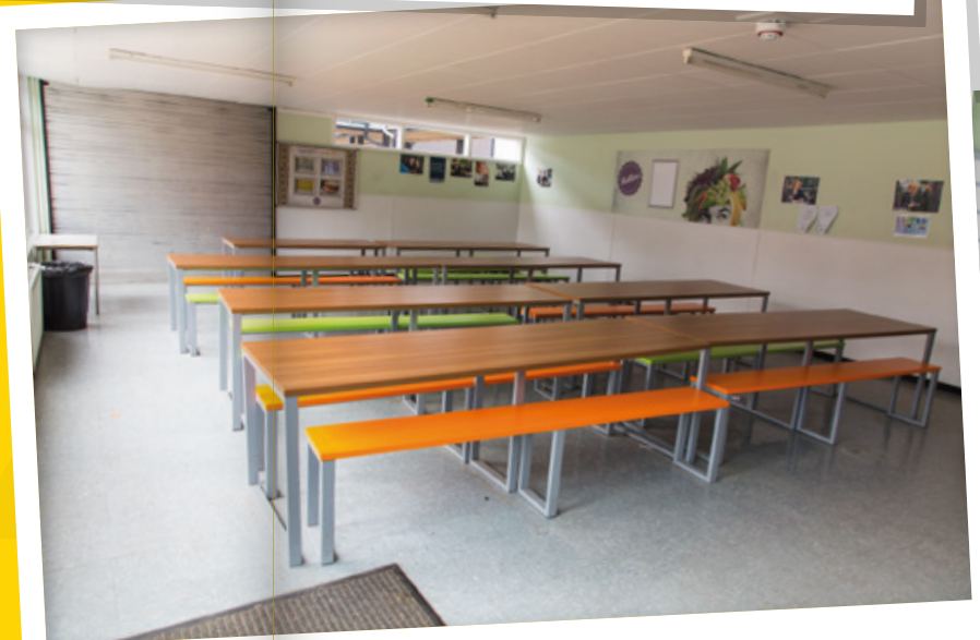
HATFIELD DINING ROOM