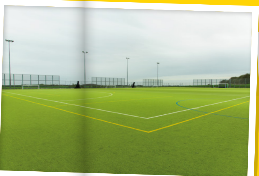
2G ASTRO-TURF PITCH